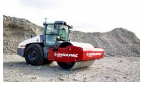
STATIC LINEAR LOAD

The greatest influence on compaction performance is the Static Linear Load, therefore Dynapac offers the highest Static Linear Load throughout the class.