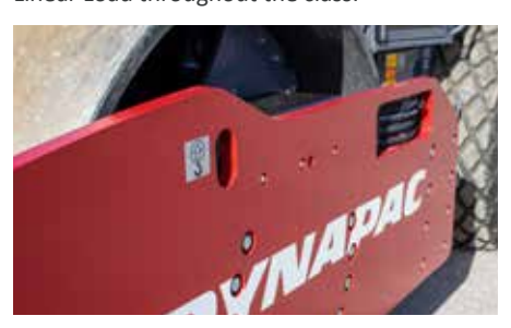
DRUM SHELL THICKNESS

The greatest influence on compaction performance is the Static Linear Load, therefore Dynapac offers the highest Static Linear Load throughout the class.