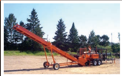
FWC35 Transport position