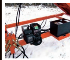
Power Pack Option

Optional engine driven hydraulic package. (Shown with hydraulic pump valve & reservoir) Gas, Diesel or Electric.