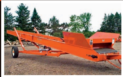
TBC3036 Materials Conveyor