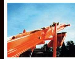
FWC with Clean Out Pan

Optional engine driven hydraulic package. (Shown with hydraulic pump valve & reservoir) Gas, Diesel or Electric.