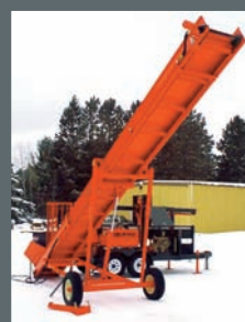
FWC30 90 degrees

The demands of material handling require a compact and versatile conveyor. MULTITEK YARDHAND Conveyors are engineered to provide years of low maintenance and rugged dependability. These heavy-duty belt or bar slat conveyors enable you to smoothly and efficiently place material where you need it. Quick couple the YARDHAND to your hydraulic equipment or select the optional engine driven hydraulic package to provide maximum power and lift for your operation.