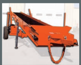
GBC30 Gas Belted Conveyor

THE IDEAL CONVEYOR FOR SMALL, MEDIUM AND LARGE SIZE OPERATIONS WHERE RELIABLE CONVEYOR OR LOADING PRODUCTION IS A PRIORITY.