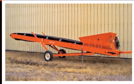
Lowered for Highway Transport