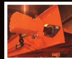
HD Hydraulic Drive Standard