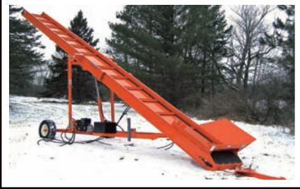
FWC30 with Firewood Processor