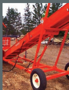
FW30 Conveyor Hydraulic Lift