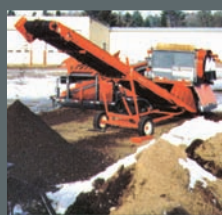
TBC3036 Trough Belted Conveyor