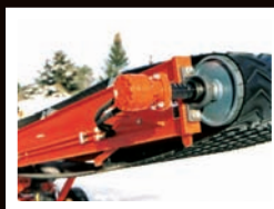
TBC Head Pulley & Scraper