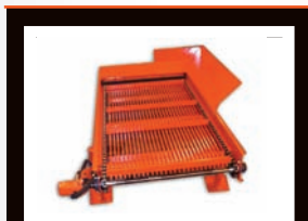
COC10 Clean Out Conveyor