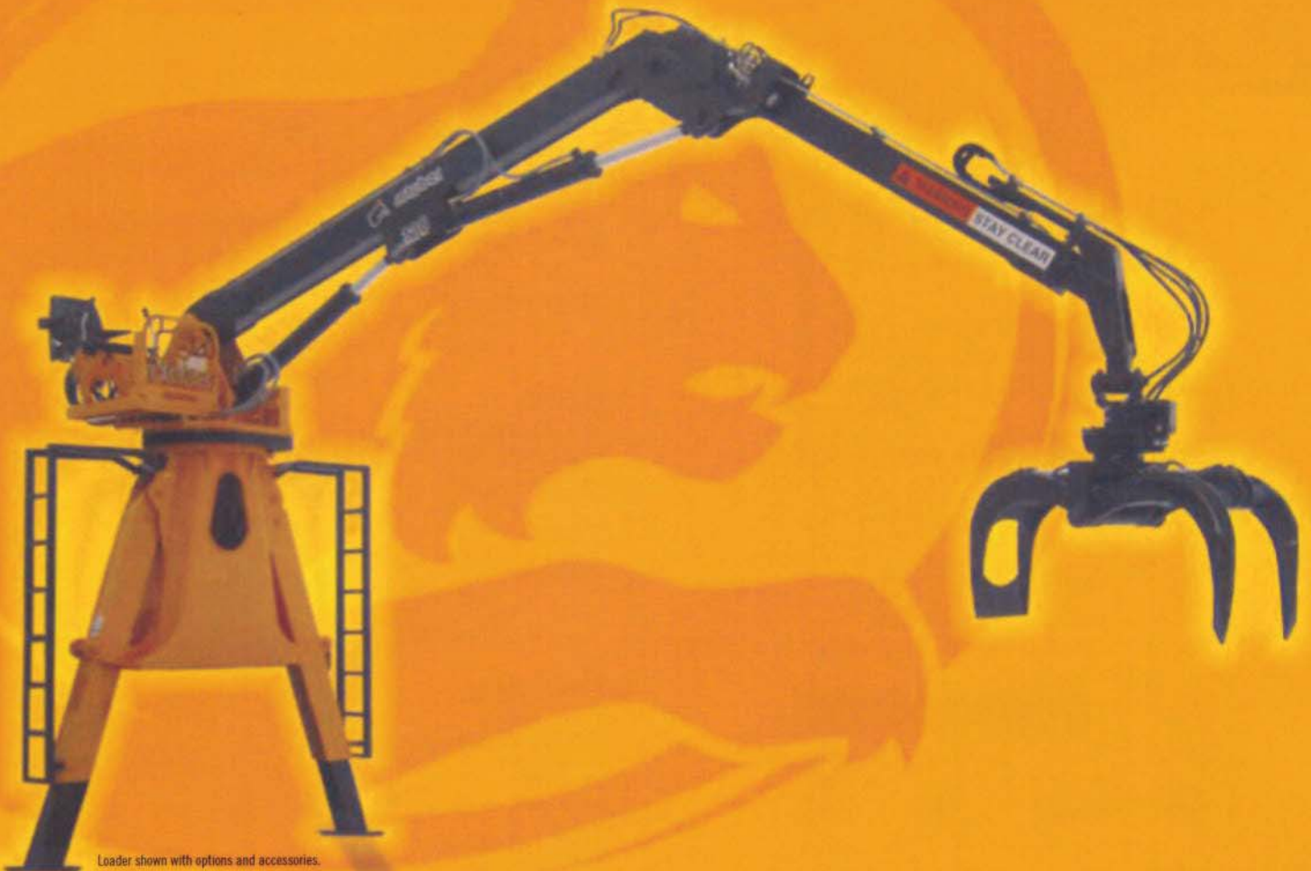
Loader shown with options and accessories.