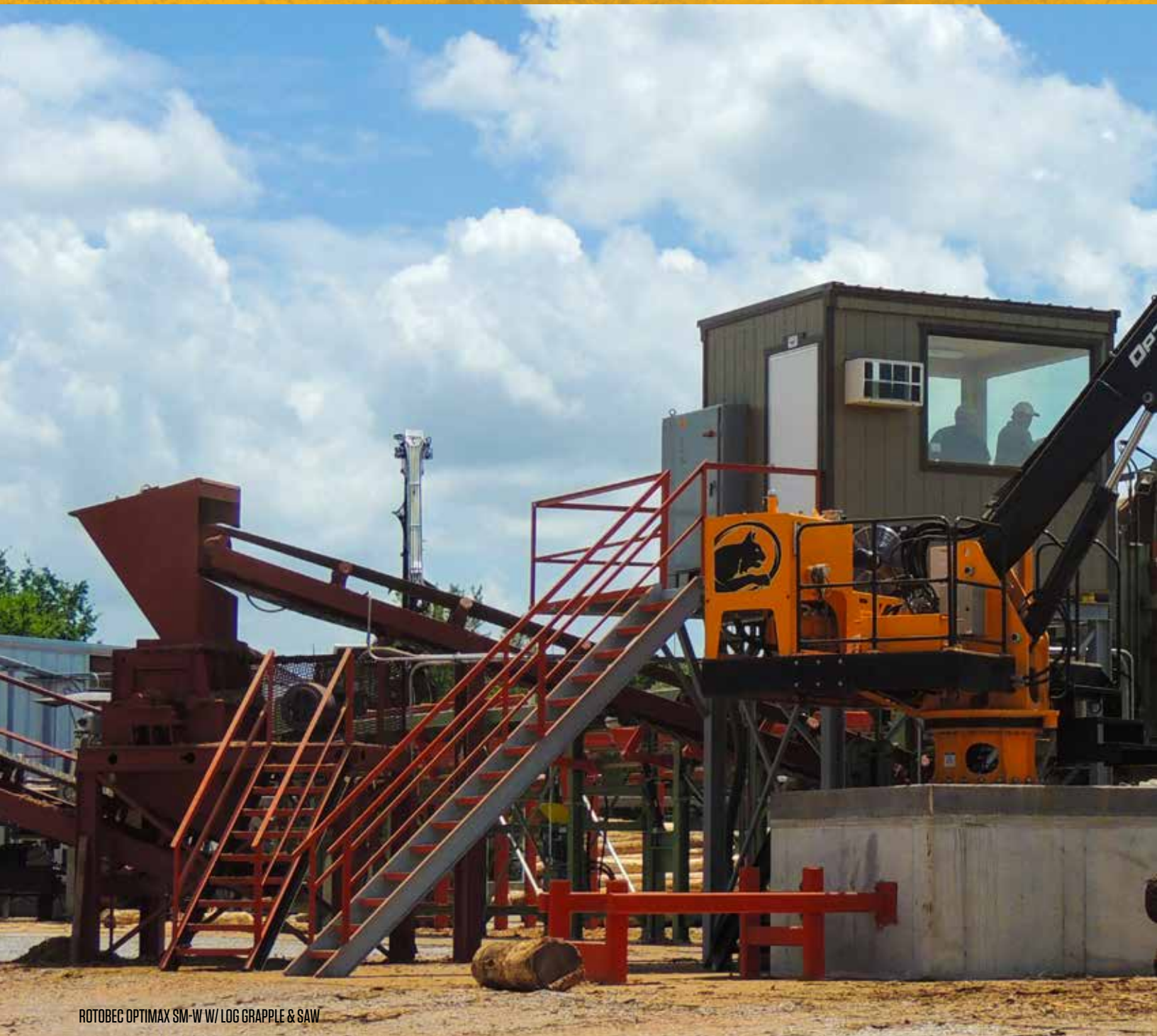
ROTOBEC OPTIMAX SM-W W/ LOG GRAPPLE & SAW

The OPTIMAX truly pushes the boundaries of what was once thought possible of a mid-weight loader. In addition to Rotobec's tough handling pedigree that comes standard in all of our loaders, we have engineered the OPTIMAX to be adaptable to every conceivable application and environment. The list of available options is incredibly extensive, making it without a doubt the most versatile loader of its kind. This highly efficient powerhouse offers a modern alternative to traditional diesel powered loaders that will significantly reduce your carbon footprint and save you thousands in annual operating costs.