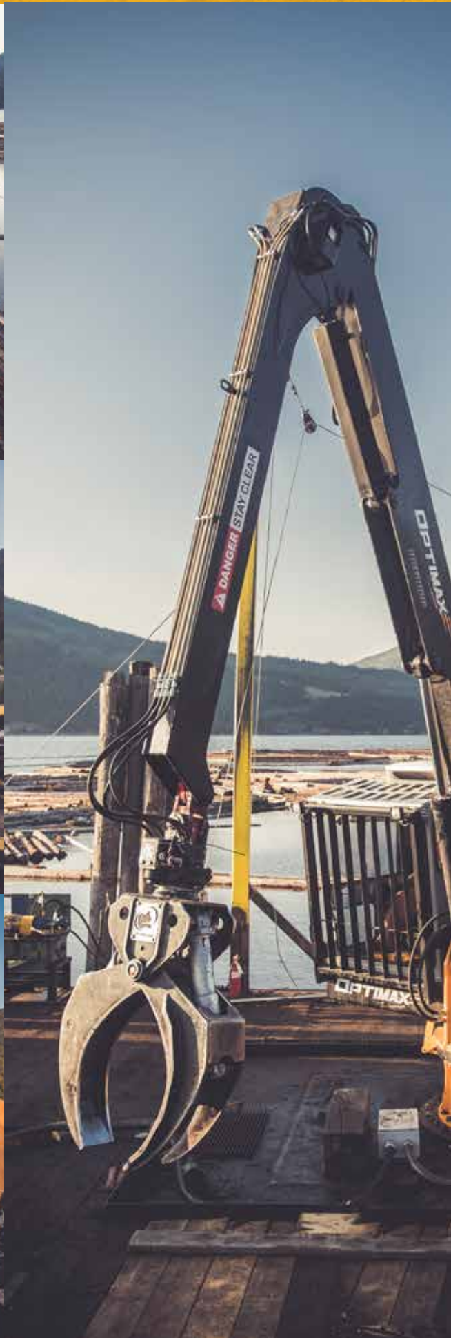
ROTOBEC OPTIMAX SM-X W/ LOG GRAPPLE