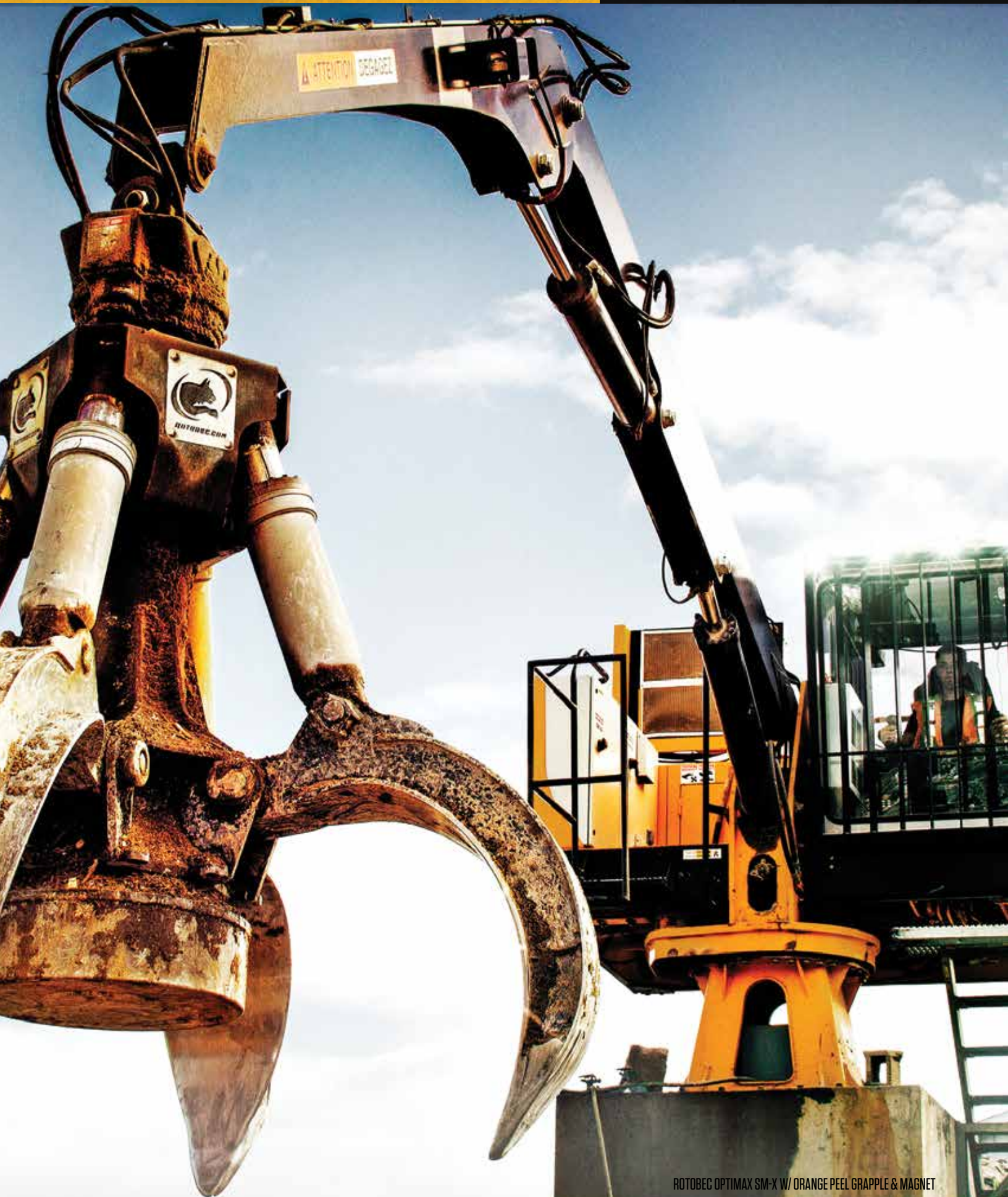
ROTOBEC OPTIMAX SM-X W/ ORANGE PEEL GRAPPLE & MAGNET