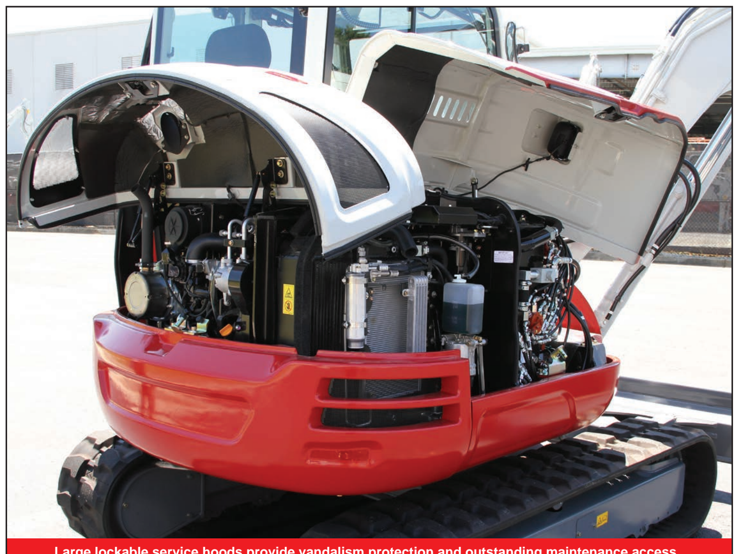
Large lockable service hoods provide vandalism protection and outstanding maintenance access.

multiple attachment presets. The cabin is spacious and features a deluxe high back suspension seat with adjustments for height, weight, fore and aft position, and tilt. Controls are intuitive and include a multi-function monitor, rocker switches for various machine functions, dial type throttle, and low effort pilot joysticks. All steel construction and a wraparound counterweight provide excellent protection and durability, and overhead opening service hoods enhance and simplify access to key daily inspection points.