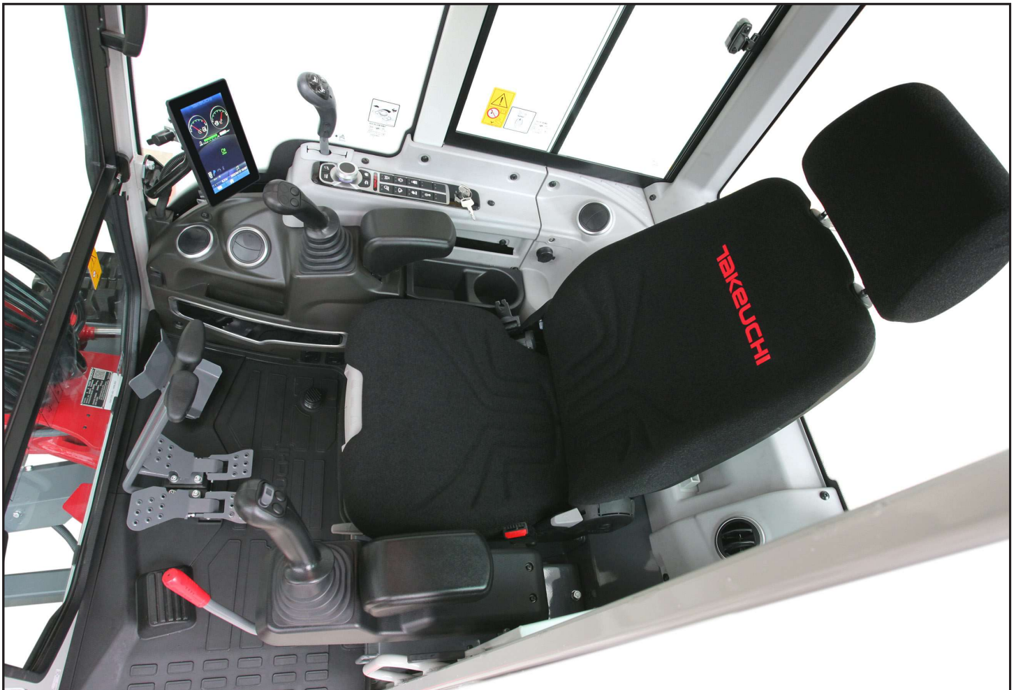
Completely Redesigned with Intuitive Jog Dial and Touch Pad Operation

Daily inspections and maintenance are easy to carry out thanks in part to a swing out engine hood and overhead opening right side cover. With the hoods open, the operator can quickly inspect the water separator, radiator and oil cooler, hydraulic oil level sight gauge, fuel level, dual element air cleaners, coolant level, engine oil dipstick, and battery.