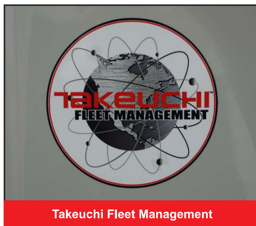
Takeuchi Fleet Management