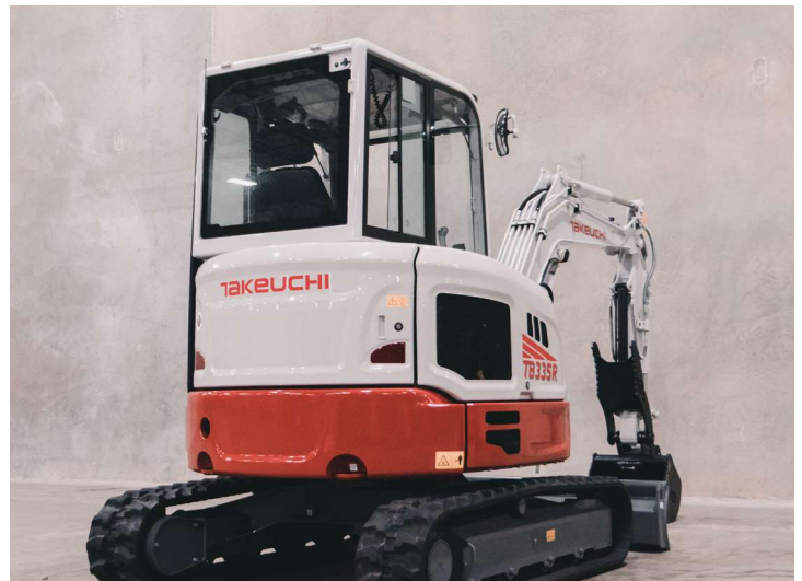
Short Tail Swing

*Functions may not be available in all countries, so please consult your Takeuchi dealer for details.