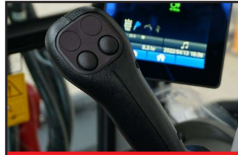
Hydraulic Joystick Controls