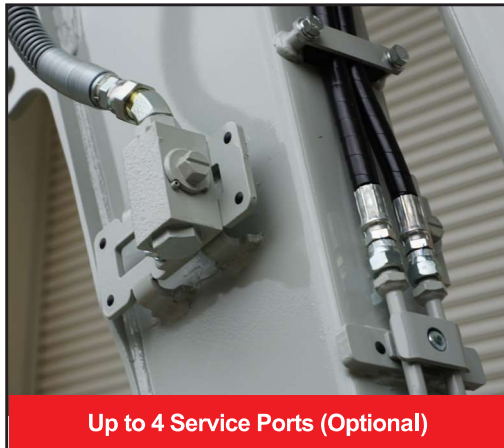
Up to 4 Service Ports (Optional)