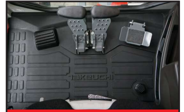
Large Floor with Foot Rest

The latest 300 series excavator, the TB335R features a minimal tail swing design that allows you to focus more on the work you are performing and worry less about rear swing impacts. Operators will find that the compact radius of the TB335R will provide excellent maneuverability and accessibility to confined worksites without sacrificing stability. While powerful bucket and arm crowd forces and a wide working range will deliver unmatched performance.