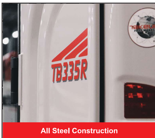
All Steel Construction