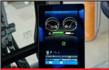
7" Touch Screen Display (CAB)