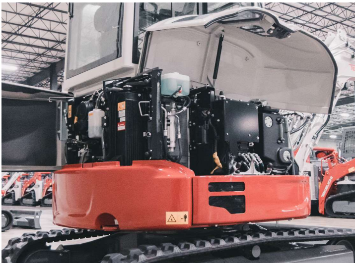
Easy Service Access with Wide-Opening Hoods